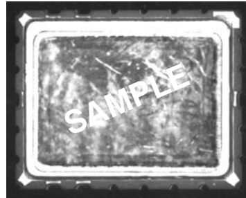
Photograph of Laser Driver IC